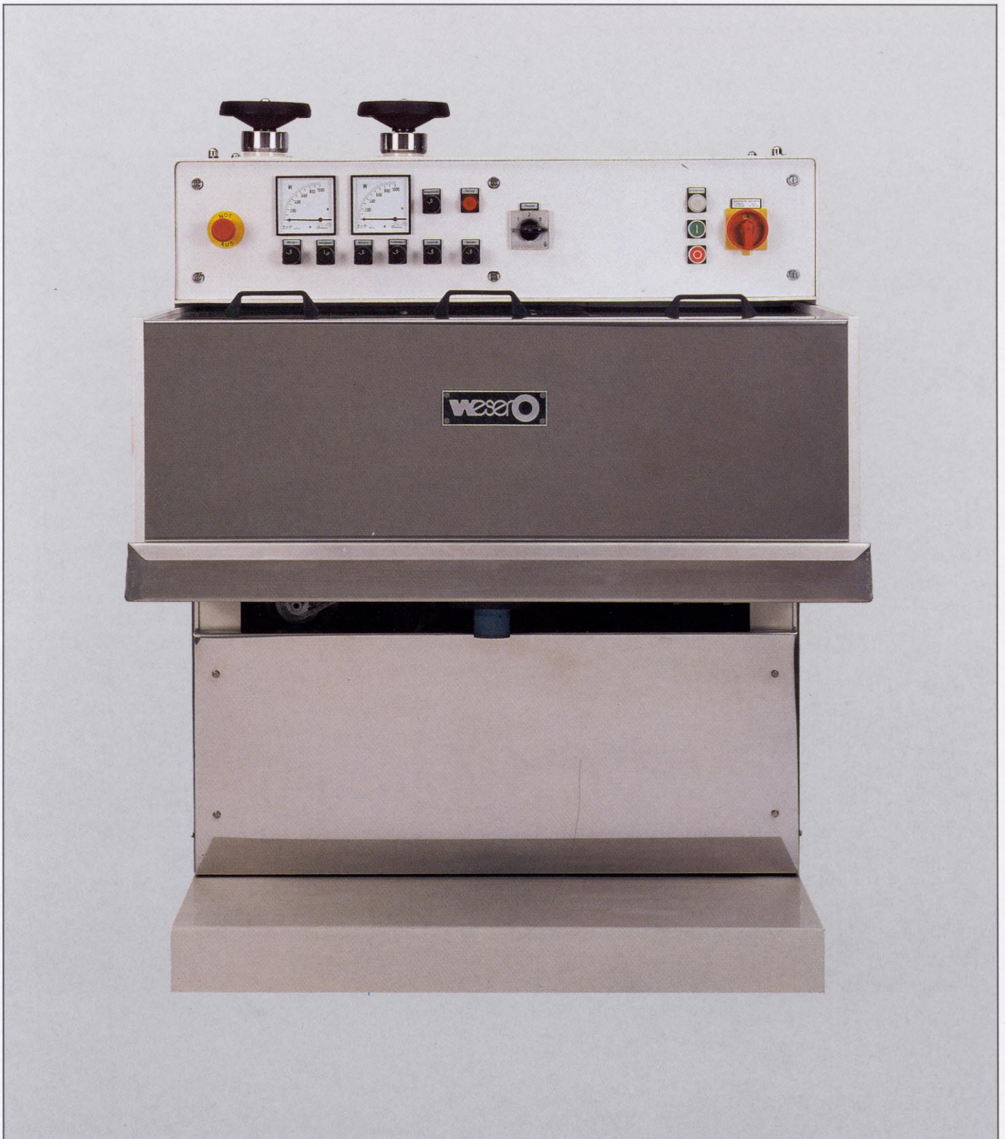
Flat Part Deburring Machine Type UNIVERSAL 450-2